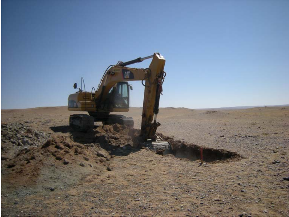
Fig. 2 Commencement of trench excavation at Three Eagles Central